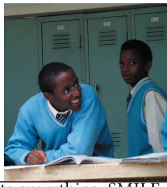
Despite everything, SMILE.

Have fun because you know you have studied enough!